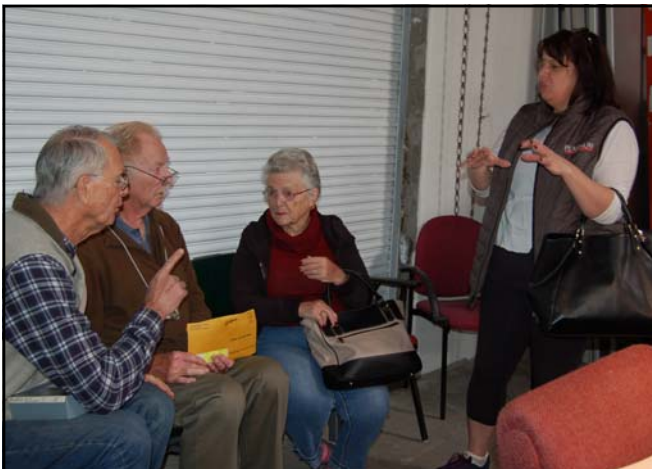
Taking advantage of the new chairs to visit old friends