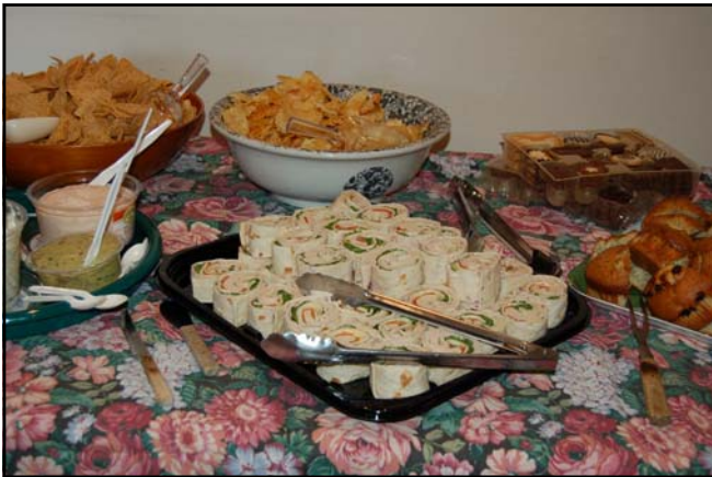
First class munchies