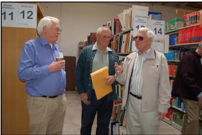
Taking time to catch up on the local philatelic scene