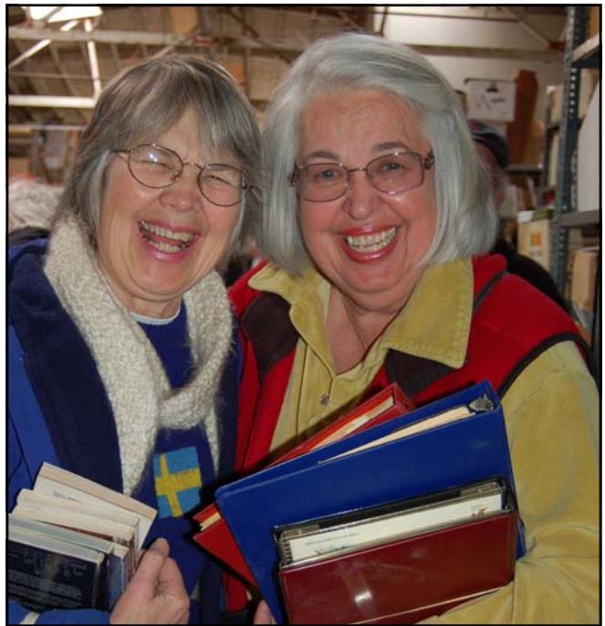
Happy customers and supporters of the WPL