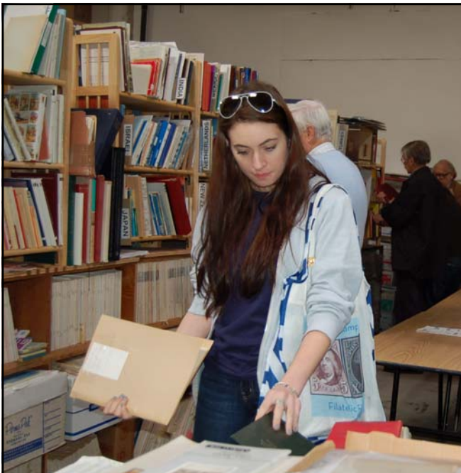
Looking for bargains in stamps and books