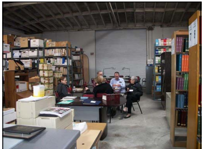
Gala Open House is over — time for a break