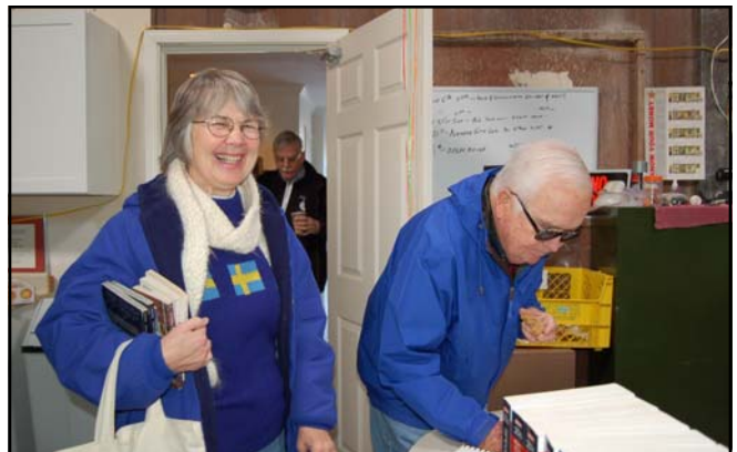
Visitors were asked to sign the Guest Register