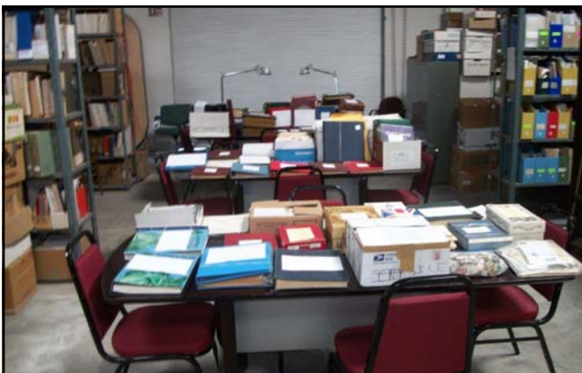
The new tables covered with stamps for sale Feb. 6

WESTPEX, Inc. Board provided funds for advertising, refreshments and matching funds for the sales of surplus collections and books, and a force of 20 people to help out!