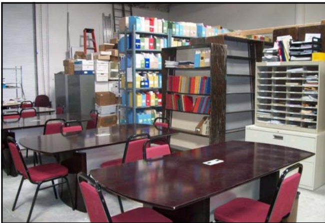
Our new work area before the Gala Open House