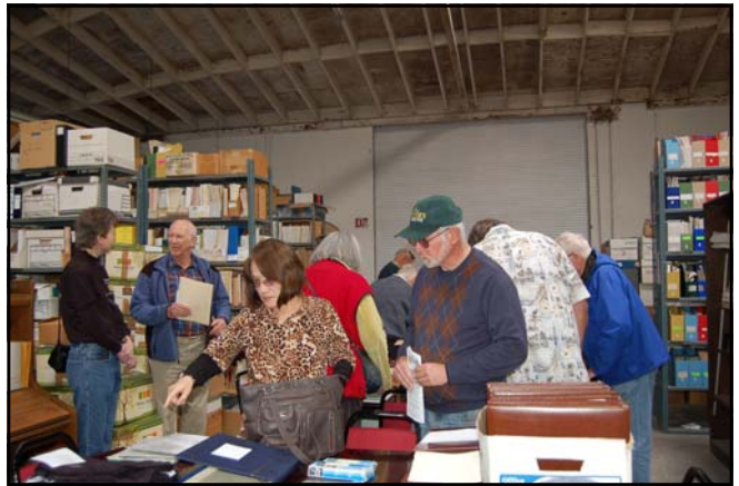
Collectors swarming the tables looking for bargains