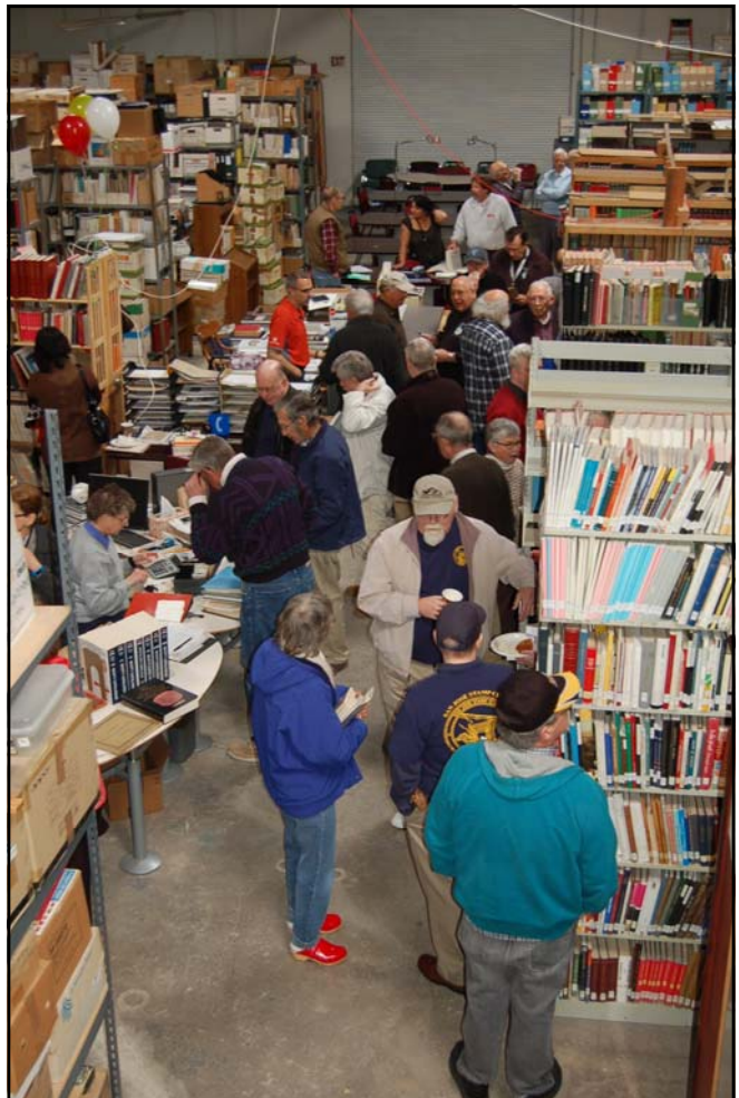
Lots of people all day long, buying and chatting