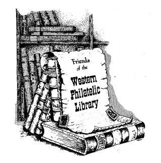
P.O. Box 2219 - Sunnyvale, CA 94087