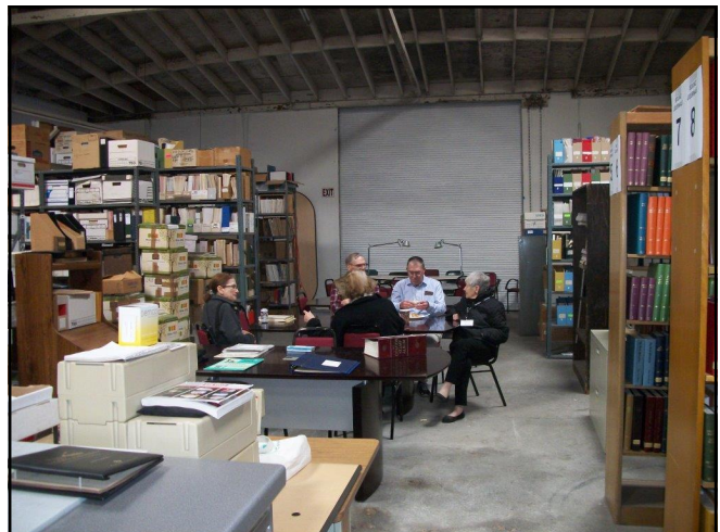
Gala Open House is over — time for a break