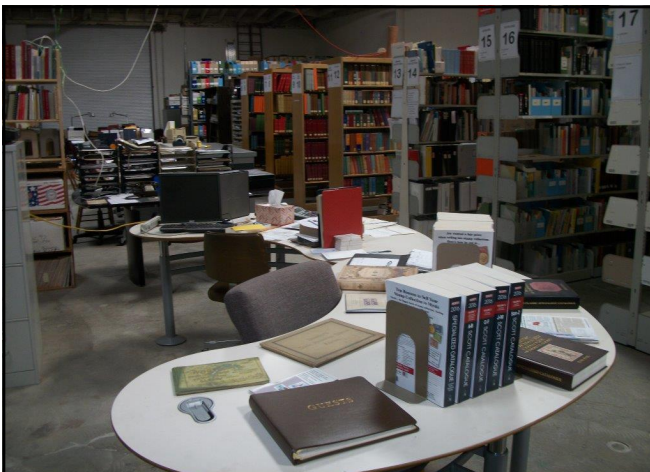
(Above) Everything is all set for the customer rush