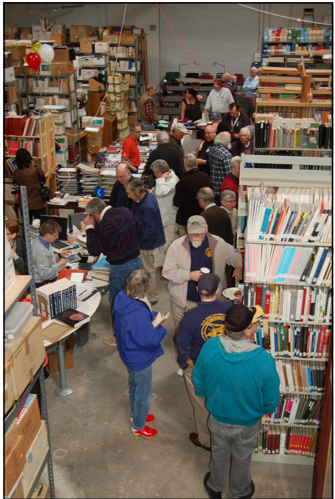
Lots of people all day long, buying and chatting