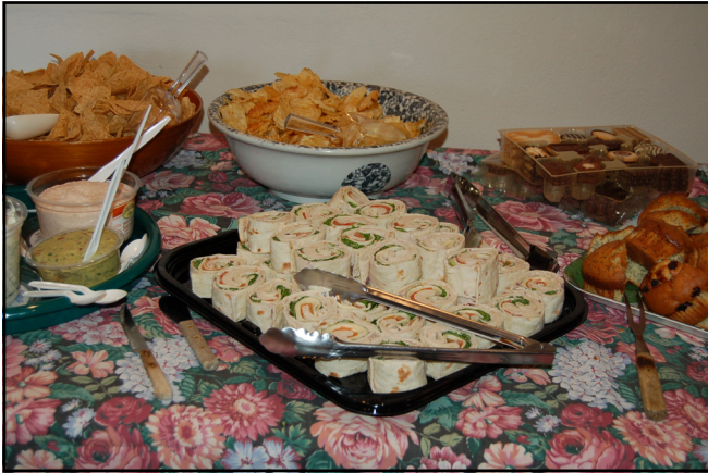
First class munchies