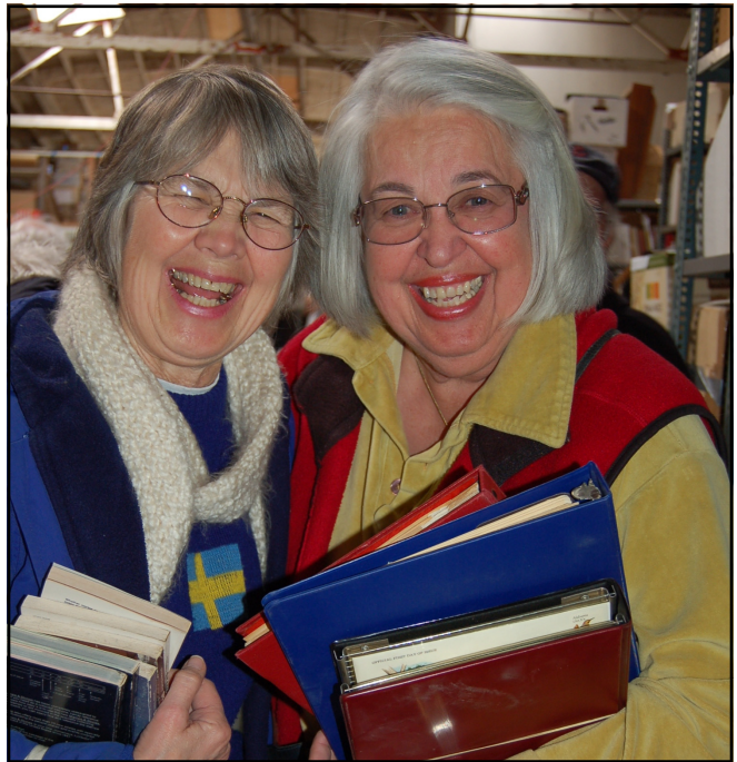
Happy customers and supporters of the WPL