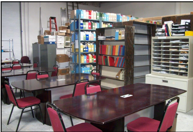
Our new work area before the Gala Open House