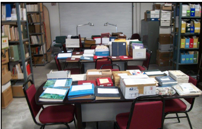
The new tables covered with stamps for sale Feb. 6

WESTPEX, Inc. Board provided funds for advertising, refreshments and matching funds for the sales of surplus collections and books, and a force of 20 people to help out!