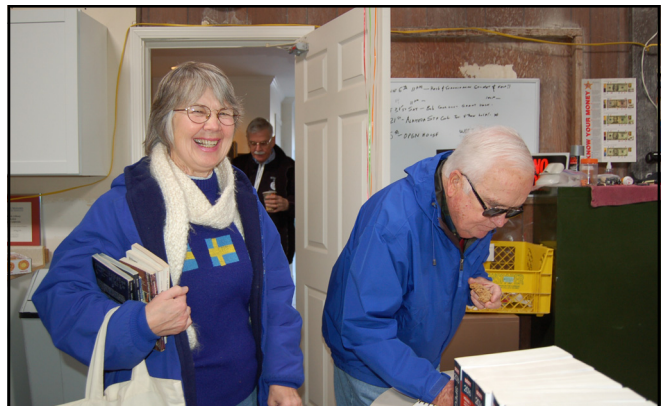
Visitors were asked to sign the Guest Register