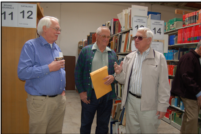
Taking time to catch up on the local philatelic scene