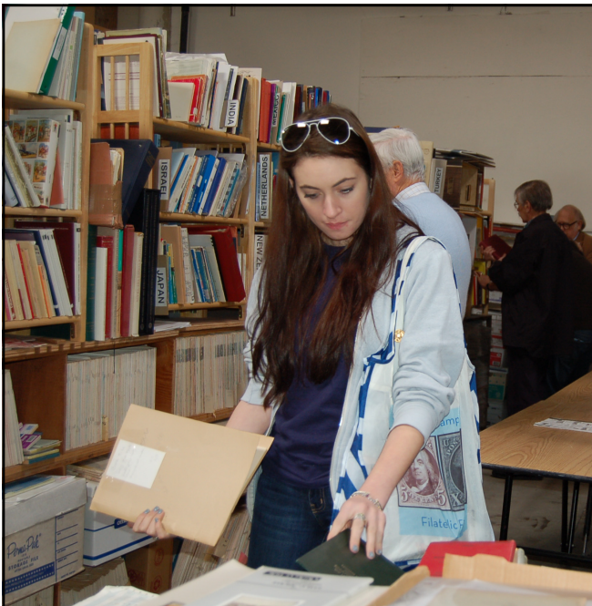
Looking for bargains in stamps and books