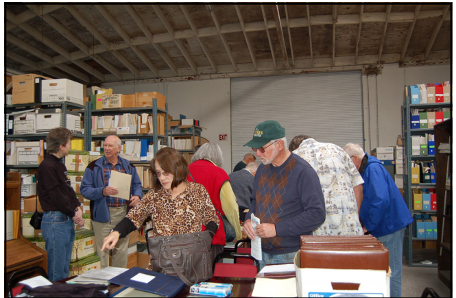
Collectors swarming the tables looking for bargains