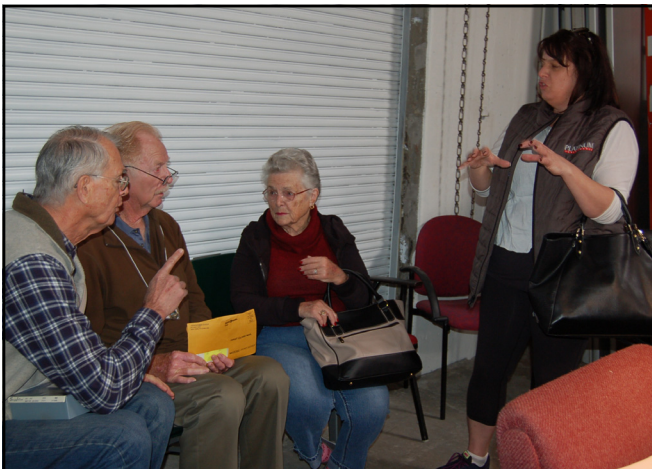
Taking advantage of the new chairs to visit old friends