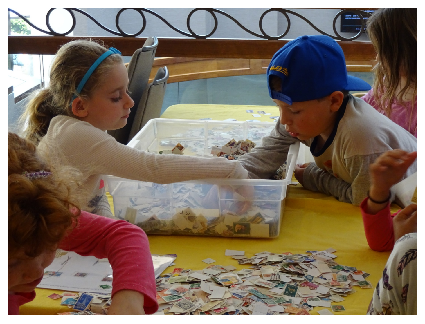
THE BAY PHIL APRIL 2018