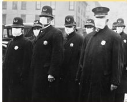
ABOVE: Police wearing protective masks in Seattle, 1918