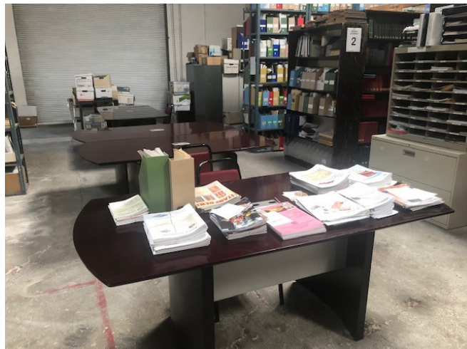
ABOVE: Improved workspace in the Library.