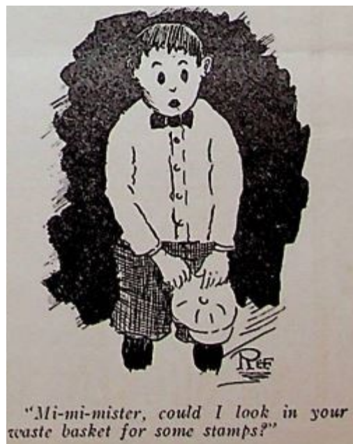
ABOVE: Cartoon from Mekeel's Weekly Stamp News, 1930